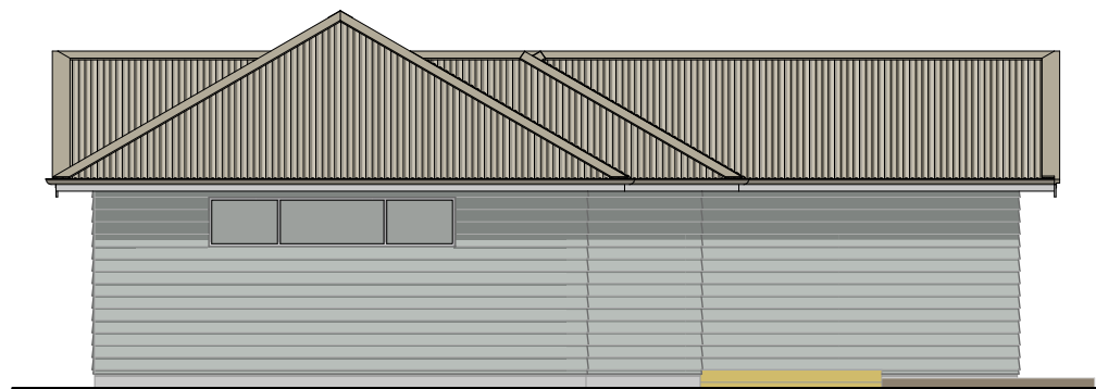
Elevation Three Scale: 1:100