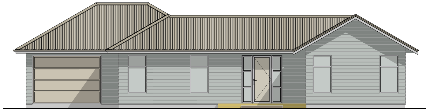
Elevation Two Scale: 1:100