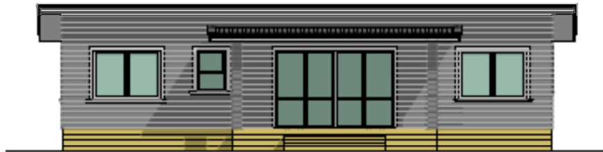
Proposed Elevation Three Scale: 1:100