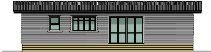
Proposed Elevation One Scale: 1:100